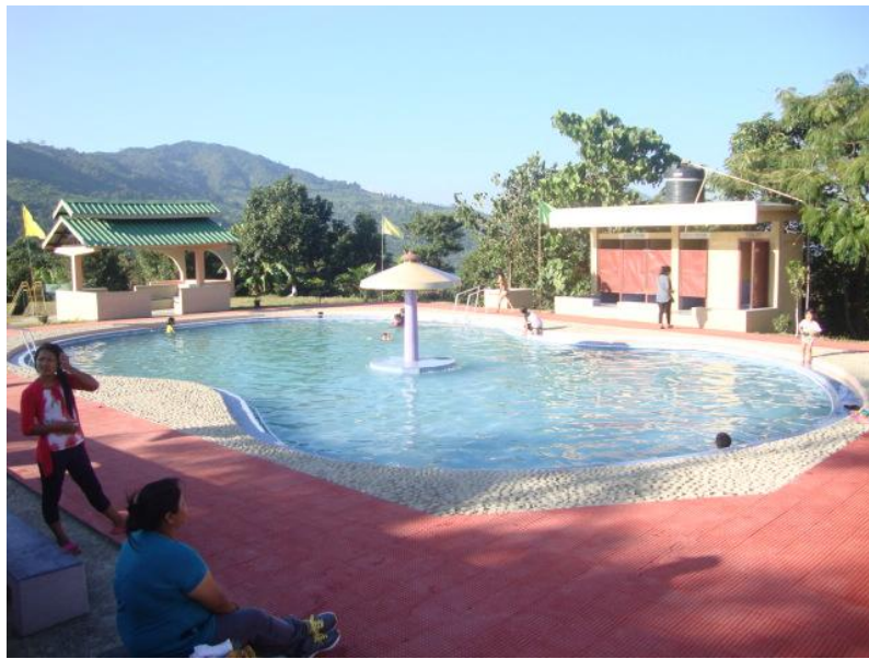
Serchhip District Park